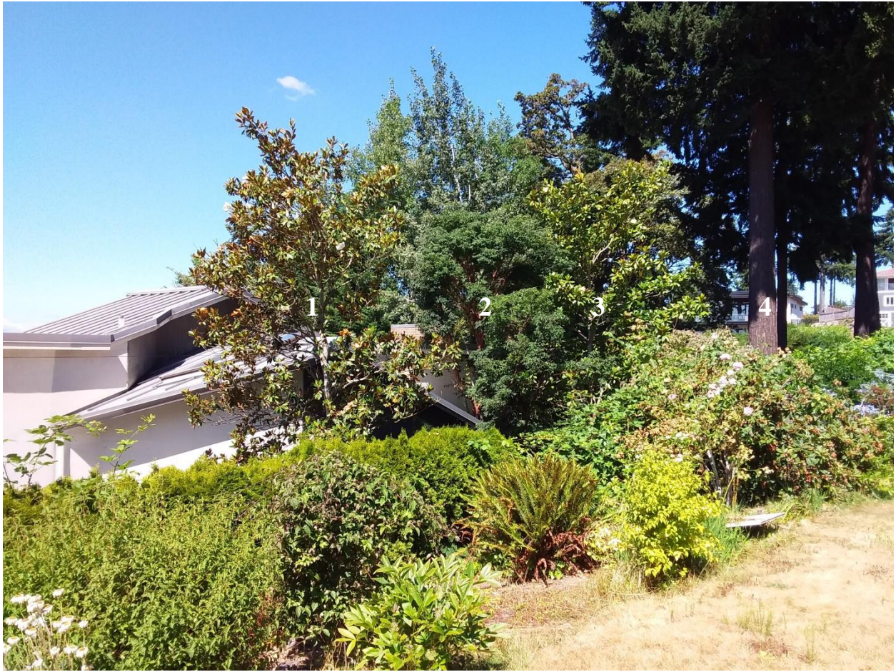
Figure 4. Looking NW at the #1-4 trees.