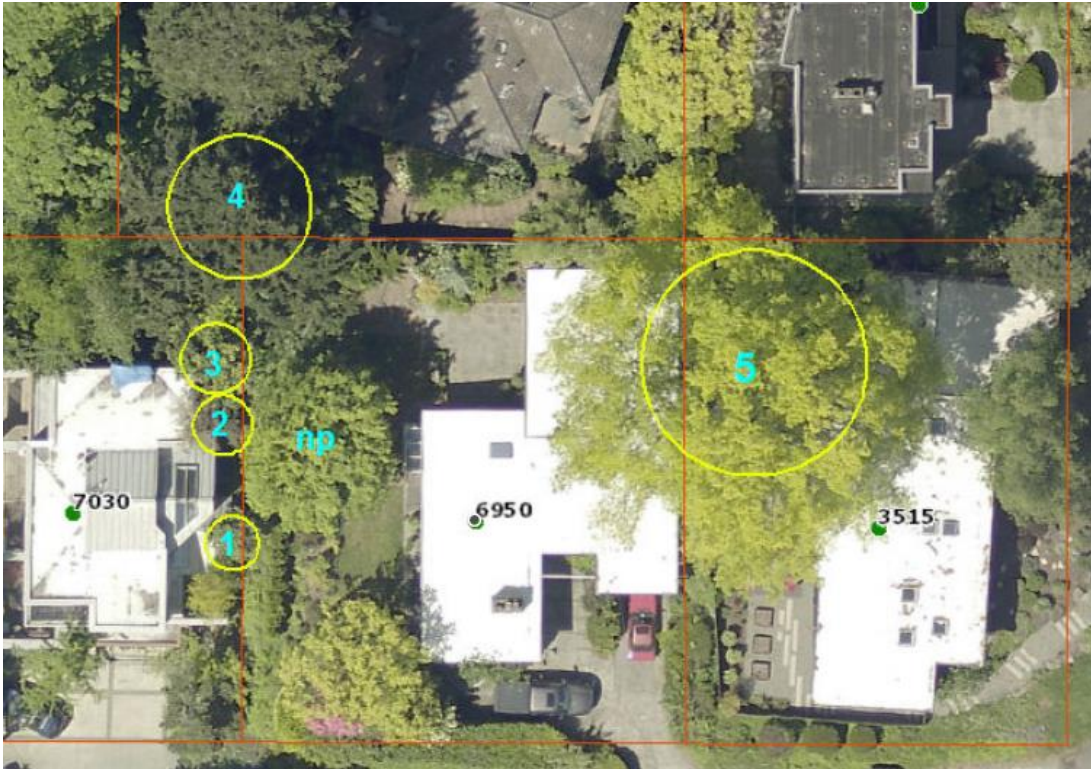
Figure 3. Aerial photo circa 2019 showing the approximate locations of the trees noted in the study (teal numerals). The yellow circles just help spot the numbers. The 'np' stands for 'not present' as this plant was not present at the time of the August 2022 site visit. It is presumed to have been removed by the previous owners in anticipation of selling the home.