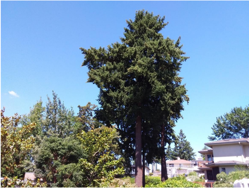
Figure 5. Looking NNW at the #4 fir and showing its conformation.