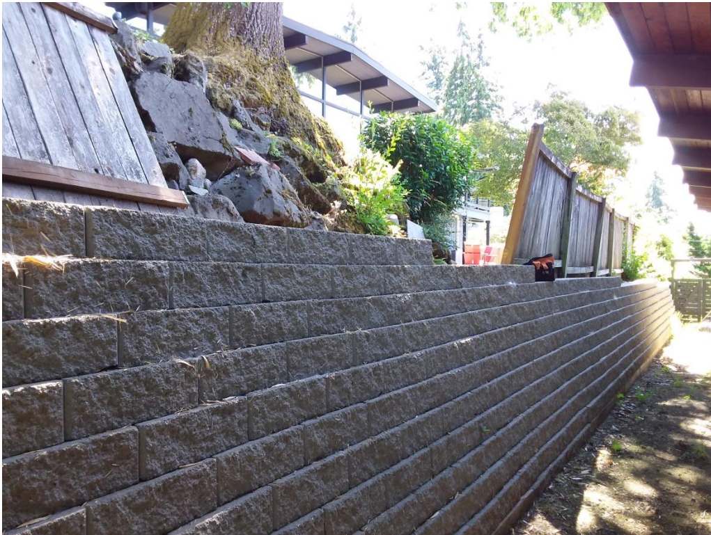
Figure 8. Looking SSE down the length of the Keystone block retaining wall running along the east side of the existing house. Note the base of the #5 oak at top center of the photo, The edge of the existing roof is visible in the top right corner of the image.