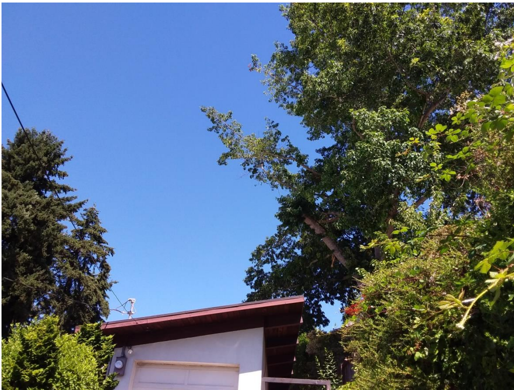
Figure 6. Looking up and north at the west side of the #5 oak's canopy. It was pruned back as to not extend over the roofline of the existing house. This was likely done in anticipation of selling the home.