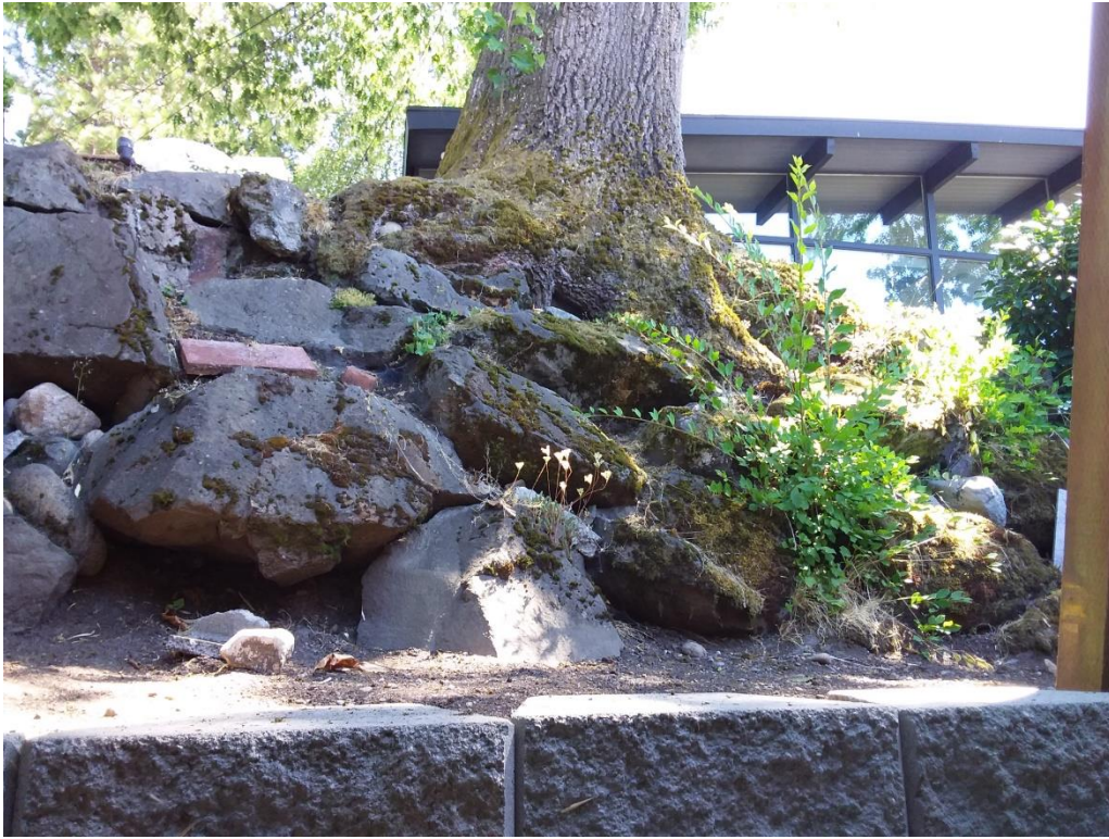
Figure 7. Looking up and east at the base of the #5 oak. The concrete blocks at the bottom of the photo are the top or the Keystone wall shown in Figure 8.